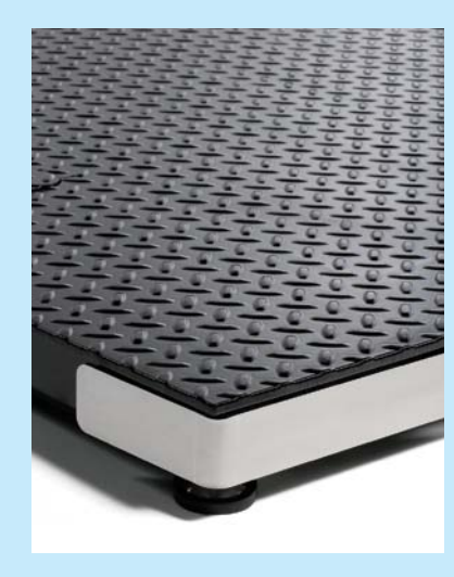
Mild steel scales are rugged enough for use in tough industrial environments.

Our Quick-Pit frame makes it easy to install a pit scale that is square and flush with the floor. Just level the frame in the rough floor opening and pour concrete. The Quick-Pit frame creates its own form. After the concrete has cured, install the scale.