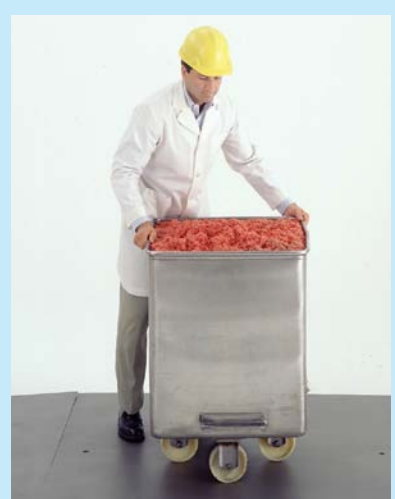
Stainless steel scales are designed for the food industry's harsh, wet environments.