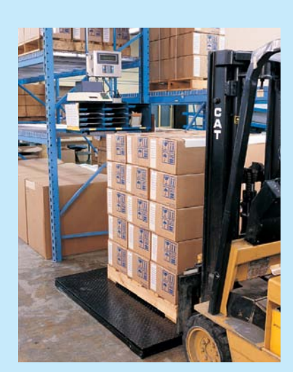
VLC scales are designed for 100% end loading to handle forklift traffic.