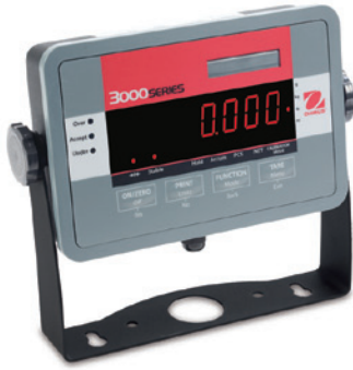
T32ME (LED version)