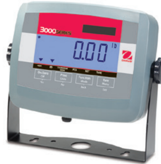
T31P Indicator shown with optional bracket