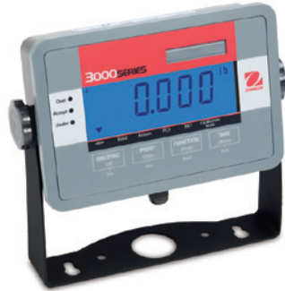
T32MC (LCD version)