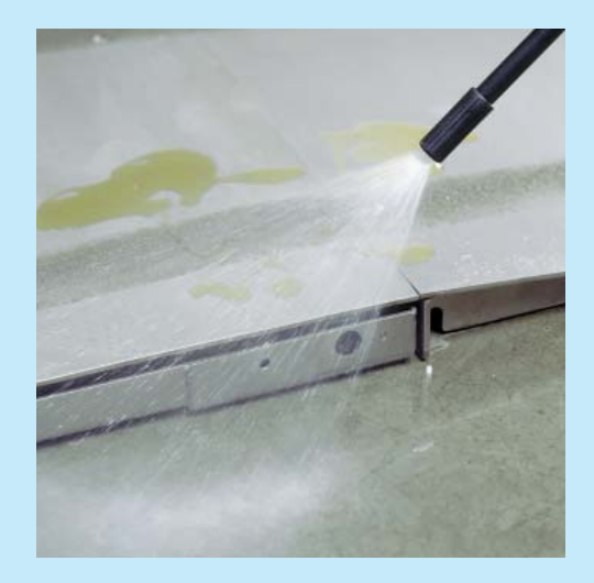
Choose from 304 or 316 stainless steel for sanitary applications.