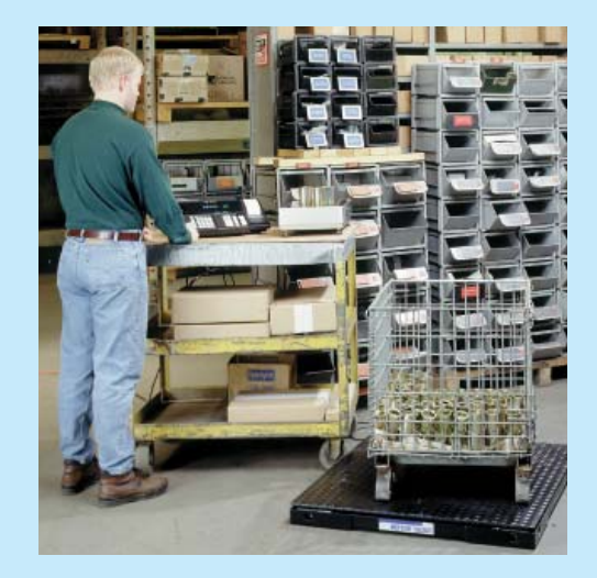
VERTEX scales are ideal for high-precision, heavy-capacity counting applications.

VERTEX scales provide the dependable repeatability needed for batching and filling.